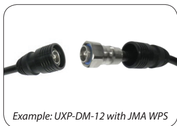
Example: UXP-DM-12 with JMA WPS