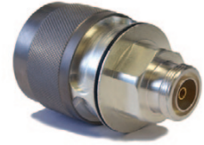
1-5/8" AllTight™ CONNECTOR