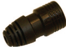
WPS-4A / WPS-4S